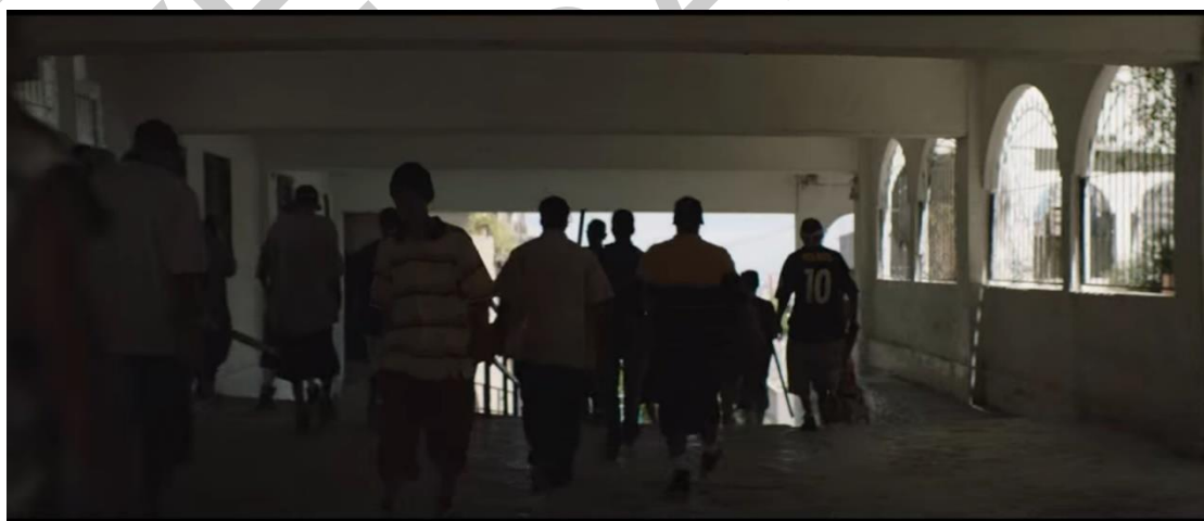
Frame 3: “It’s cool, to hell with it.”