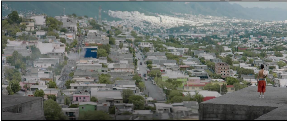
Frame 5: "Sincerely - "