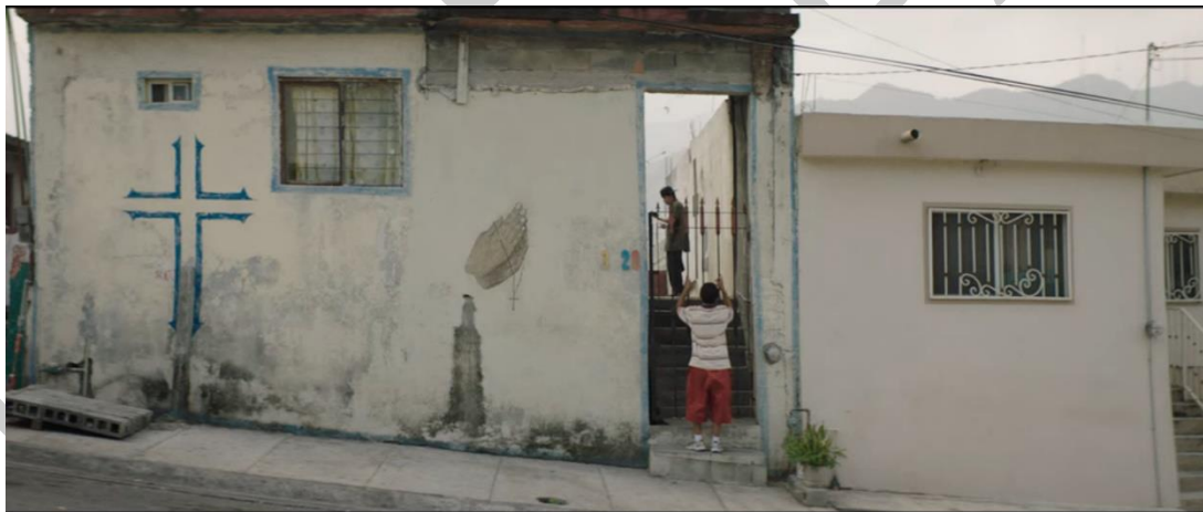
Frame 2: “But of course, from the bad side I did have offers”